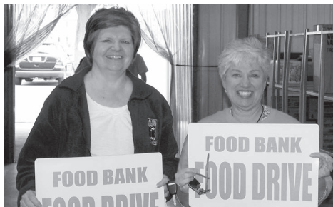
Member agency volunteers gearing up to "sweep" neighborhoods with letter carriers during the 2012 Stamp Out Hunger.