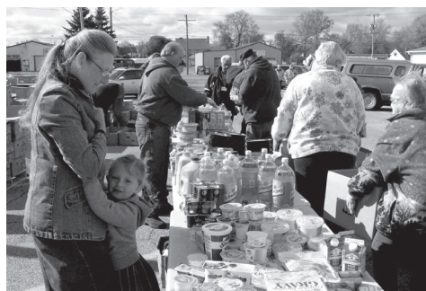
Patrons select items they need in Marshall County.

Recognizing that not all households in need have access to food pantries in our six-county service area, the Food Bank has initiated a Mobile Pantry Program. Since March, the Food Bank has hit the road each week, distributing food in Elkhart, Kosciusko, LaPorte, Marshall and Starke Counties, delivering nutritious food directly to people in need of food assistance. Despite the fact that the Food Bank has 185 member agencies in its six-county service area, there are areas where the demand exceeds what is available and barriers due to hours of operation and lack of public transportation. Mobile food pantries enable the Food Bank to supplement the work of its member agencies and meet the growing demand.