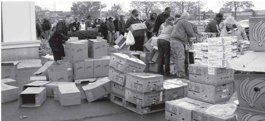
The Mobile Pantry Team working to fill the need.

Regional meetings are held every month in Kosciusko, LaPorte and Marshall Counties. These meetings offer an opportunity to network, share challenges and triumphs and keep updated on the activities of the Food Bank.