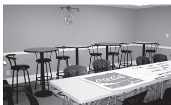
Tables and chairs offer the opportunity to spark conversation in the Food Bank's new Innovation Seed Center.