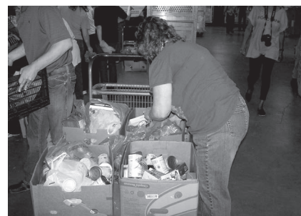
Thanks to the National Association of Letter Carriers and the greater South Bend community – the 2012 Stamp Out Hunger collected over 133,000 pounds of non-perishables.