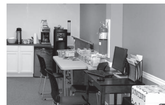
The Innovation Seed Center offers computers.