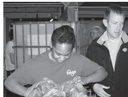
Kroger management volunteers unload and sort donations.