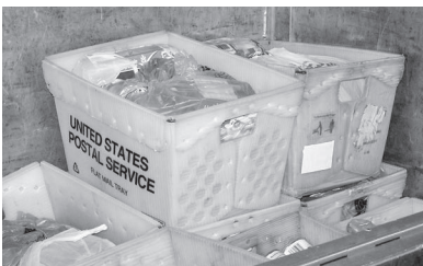
Agency volunteers sort and unpack non-perishable donations.

Stamp Out Hunger takes place on the second Saturday in May – next year's drive is May 11, 2013.