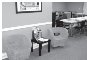
Food Bank's new Innovation Seed Center offers space for businesses and organizations to brainstorm and create!