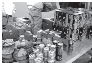
Mobile pantries offer a variety of items for those in need.

To date, the Food Bank has conducted four mobile pantries in Elkhart County, distributing 30,558 pounds of food to 810 households/2,762 individuals; two mobile pantries in Kosciusko County, distributing 14,797 pounds of food to 368 households/1,147 individuals; two mobile pantries in LaPorte County, distributing 14,977 pounds of food to 150 households/540 individuals; two mobile pantries in Marshall County, distributing 15,135 pounds of food to 298 households/1,015 individuals; and two mobile pantries in Starke County, distributing 15,595 pounds of food to 319 households/1,093 individuals.