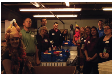
Gibson Insurance assembling Senior Nutrition Bags at the Food Bank.