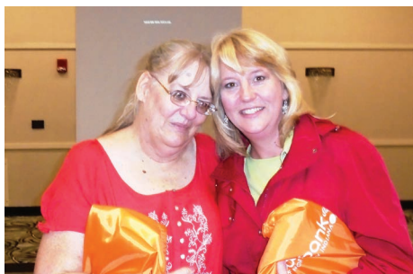
The Storehouse in Mishawaka.