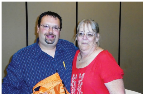
State Street Church in La Porte.