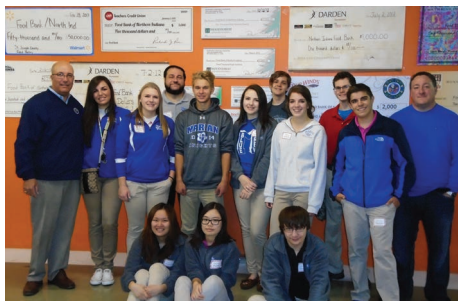
Students from Marian High School commemorated their 50th Anniversary by volunteering at the Food Bank and various non-profit organizations during a community plunge day.