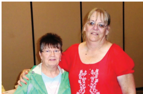
Albright United Methodist Church in Mishawaka.