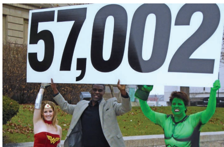
Gibson Insurance Group engaged a variety of businesses and organizations to raise food and funds during the month of November with 'Wonder Woman' and 'The Hulk' scaling Gibson's office building on a brisk December morning to reveal 57,002 pounds of food collected for the Food Bank!

Thank you to our volunteers who donated 25,837 hours to the Food Bank in 2014 - an increase of 37% over 2013! Volunteers averaged 3.6 hours per visit helping with a variety of projects to keep the Food Bank operating. Volunteers packed 2,000 Food 4 Kids Fun Packs each week and packing nearly 750 Senior Nutrition Program bags each month.