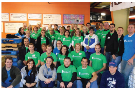
Team members from McGladrey LLP volunteer each year at the Food Bank assisting in a variety of the Food Bank's operations.