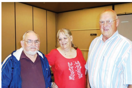
Christian Community Food Pantry in Walkerton.