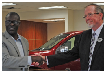
The Jordan Automotive Group has been the Food 4 Kids presenting sponsor since 2009.

During the 2014-2015 school year, the Food Bank partnered with 36 schools in Elkhart, LaPorte, Starke and St. Joseph Counties. The Jordan Automotive Group has been the Food 4 Kids presenting sponsor since 2009.